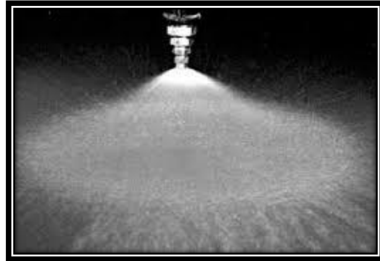
Liquid spraying of beneficial bacteria onto composts and fertilizers is easy and reliable