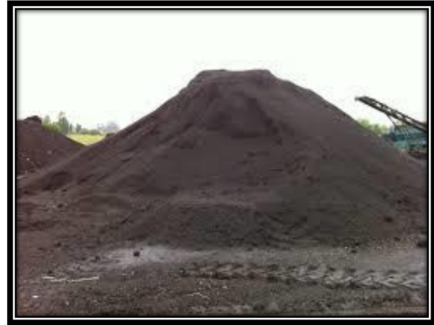
Manure static pile treated with BioCompost