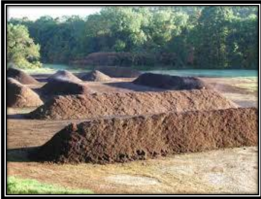
Manure windrow treated with BioCompost

BioCompost is a premier blend of high concentrate specialty microorganisms that accelerate the decomposition of all animal manures and green waste to form a stable and odor free end product