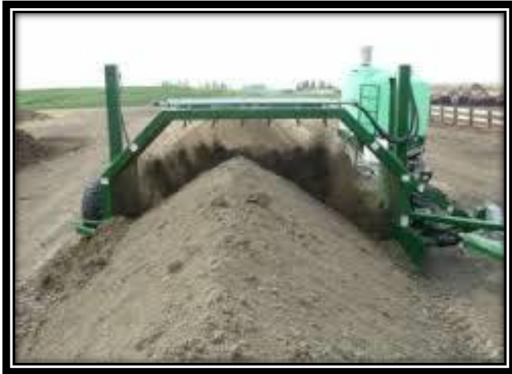
Spray application of BioCompost onto compost piles

Spray application of liquid microbials onto dry fertilizers, amendments, soils and mulches provides significant microbial biodiversity and converts fertilizers into valuable biofertilizers